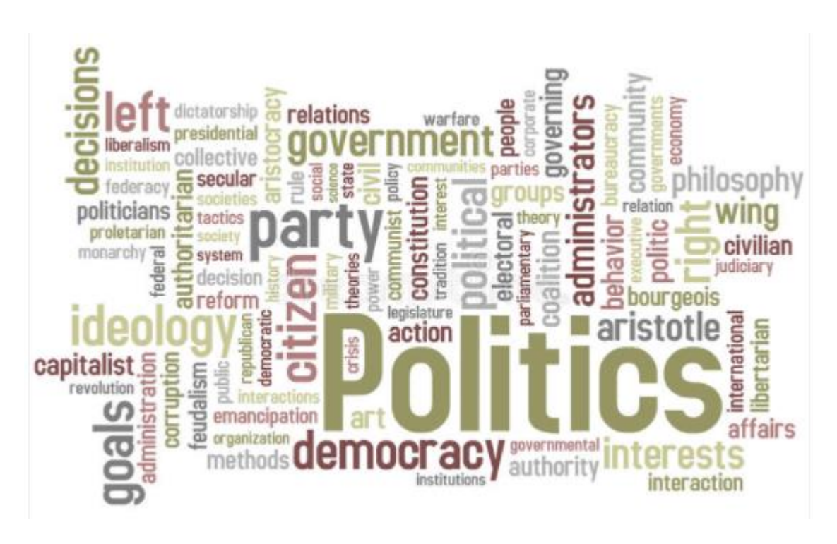
Tupton Hall - A Level Politics